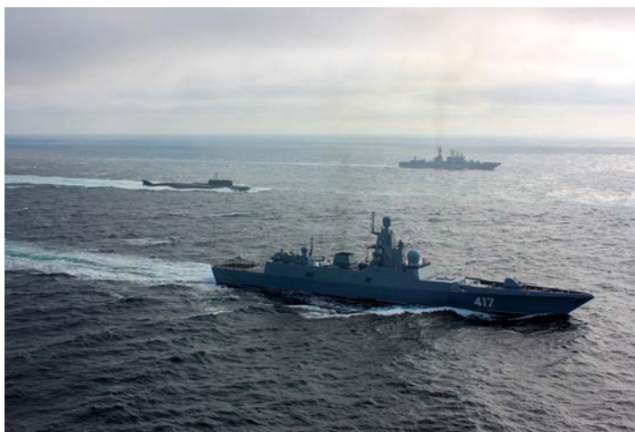
Figure 2. Russian Northern Fleet submarines and vessels