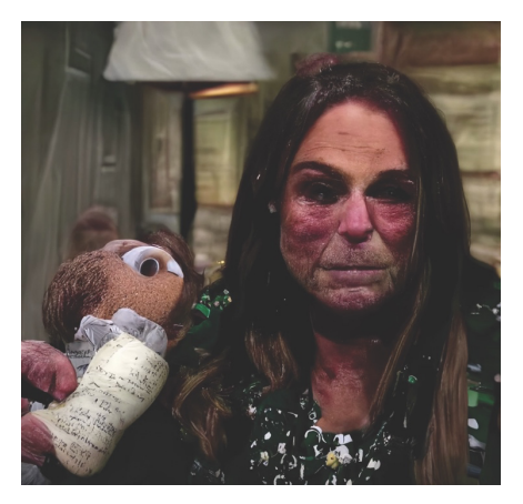
Figure 1. Example of the Loab solution to the DALL-E-2 model

These disturbing phenomena demonstrate that it is a logical fallacy to believe we can extrapolate from human experience how an artificial intelligence might behave. Before any AI system is deployed, the ODNI must develop ethical controls that address the explainability, alignment,